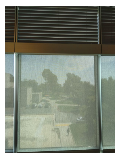
The lower shade has a 3% openness that provides views and outdoor connection while shielding the occupant from glare and heat.

At two Los Angeles area demonstration sites, retrofit packages of automated shading, daylight harvesting, LED lighting, and advanced lighting controls show significant energy savings. Lighting energy use after installation of the retrofit packages is down 35% and 42% and the whole building (site) energy use for the full package at these sites was reduced 25% and 15% .