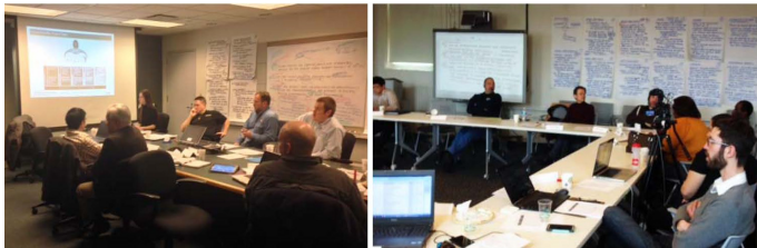
Figure 7: Alignment and goal setting CM stage.

In early 2014, the core team conducted the alignment and goal setting meeting with all project team members in attendance to discuss and organize the major framework for their AER project (see Figure 7). To accomplish this task, project team members, with the aid of CBEI researchers and facilitators, outlined an agreed to Mission Statement, which is the first of the seven ID protocols necessary to the ID AER Roadmap . Thereafter, the same team members agreed on the