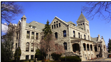
Figure 5: Building D exterior.

The fifth demonstration project, Building E, is a three-story building, approximately 18,000 ft 2 in size. It is a mixed-use building with three separate programs; municipal offices, a police department, and even a public library (see Figure 6). The building was constructed in 1889 as a load bearing brick masonry building and today has insulated windows and an asphalt shingle roof. In 2003,