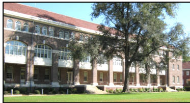
Figure 2: Building A exterior.

The owner of Building A was motivated to complete the AER project because of increasing energy costs, tenant comfort issues, and impending equipment replacement due to projected unit end-of-life scenarios. With assistance from CBEI researchers, an M+V system was installed in 2011 to establish pre-retrofit energy baselines and to facilitate predictive modeling. Through extensive site assessment work, CBEI researchers identified several energy efficient measures (EEMs) to implement as part of the ID AER project. These included the use of enhanced building automation and controls, the replacement of a condenser unit, and a variety of envelope measures focused on reducing air infiltration.