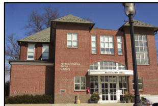
Figure 6: Building E exterior.