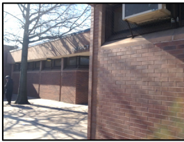
Figure 3: Building B exterior.

As part of the original site assessment work, CBEI researchers identified several systems based engineering issues within the building needing to be addressed. This resulted in a list of preliminary EEMs including a lighting retrofit, the use of enhanced building automation and controls, and several possible envelope measures including the addition of roof insulation, the prevention of air infiltration, and the replacement of single-pane windows.