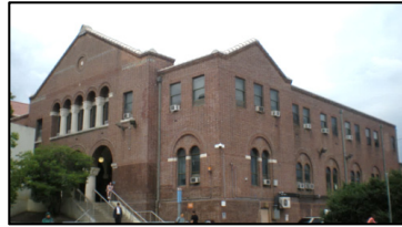
Figure 4: Building C exterior.